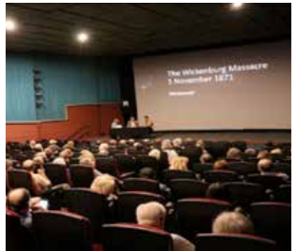
Wickenburg Massacre, Who Dunit? Panel discussion program made possible by Arizona Humanities

Roberta and Joel Rogers Trust, $2,266,781