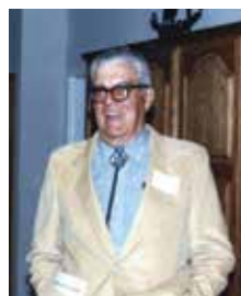
Aiken Fisher, DCWM archives