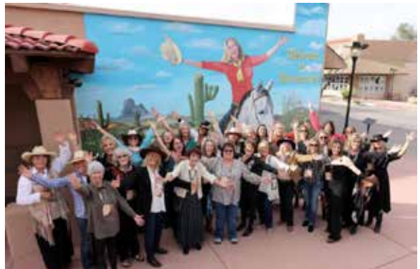
Cowgirl Up! 2022 artists

Bill Otwell Architects Ben's Saddlery Best Western Rancho Grande Big O Tires Sage Gallery Western Laundry Wickenburg Country Club