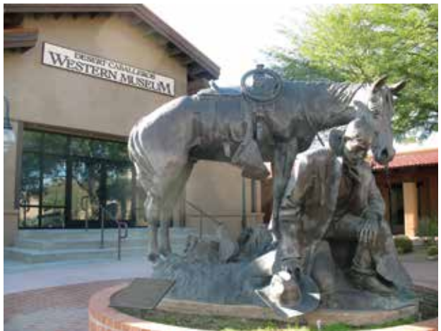
Joe Beeler ©, Thanks for the Rain , DCWM Collection, photo © Wayne Norton

The Boyd Ranch will be a regionally recognized facility for educational, equestrian, and recreational activities that preserve Western heritage.