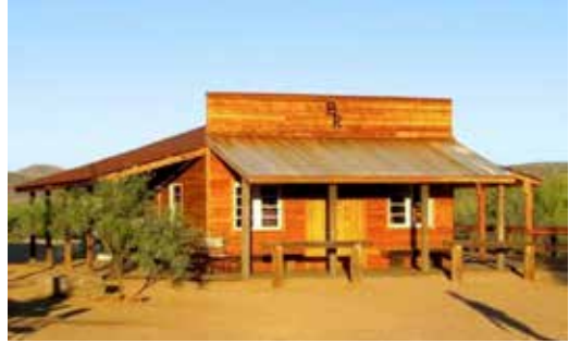
Boyd Ranch Educational Center