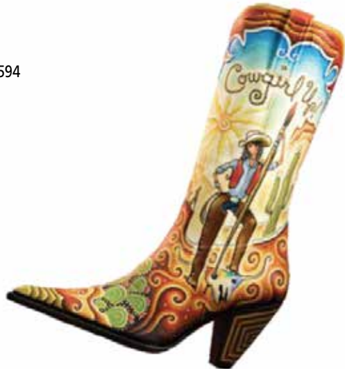
Boot illustration © Tim Zeltner/i2iart.com

185 pieces sold to 125 buyers from March 24 – September 3, grossing $830,594