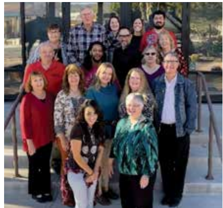
DCMW staff, December 2021