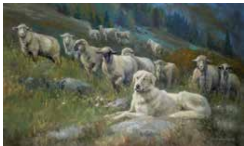
Veryl Goodnight, No Bed of Roses , oil on linen, 32" x 48", Cowgirl Up! 2022 Museum Purchase Award