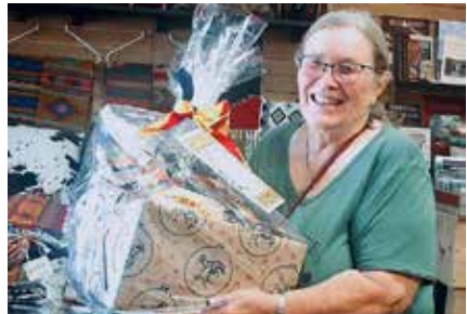
A box full of retail items won at the Members' Appreciation Night