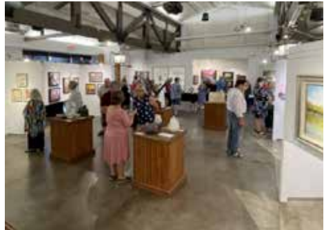
West of Center exhibition opening, July 29, 2022