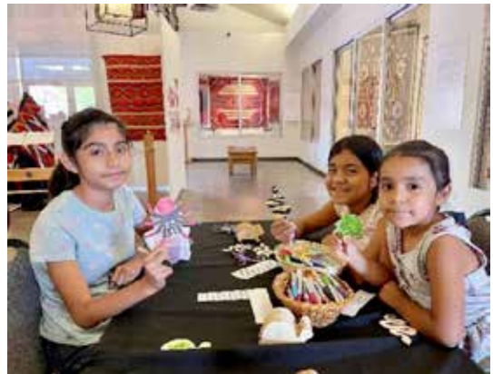
BearCat Family Friday presented by The Etnyre Foundation