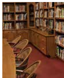
DCWM Eleanor Blossom Library, photo © Gregory McNamee