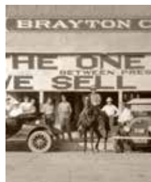
Brayton Commercial Co.

Summer/Fall 2020: acquisition of the Craig Motor Crafts property with funding from an anonymous donor