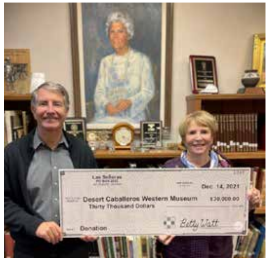
Las Señoras de Socorro annual donation