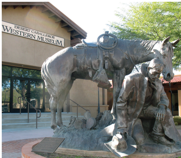
Joe Beeler © Thanks for the Rain , DCWM Collection

The Boyd Ranch will be a regionally recognized facility for educational, equestrian, and recreational activities that preserve Western heritage.