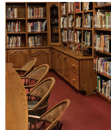
DCWM Eleanor Blossom Library