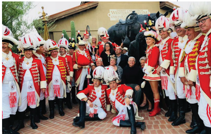
Red Sparks