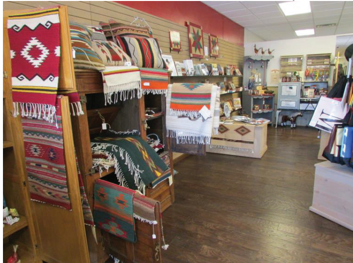
DCWM's Ranch Dressing Retail Store

Desert Caballeros Western Museum is a proud member of the Museum Store Association professional organization which establishes best practices and ethical standards for the field.