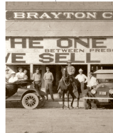
Brayton's General Store