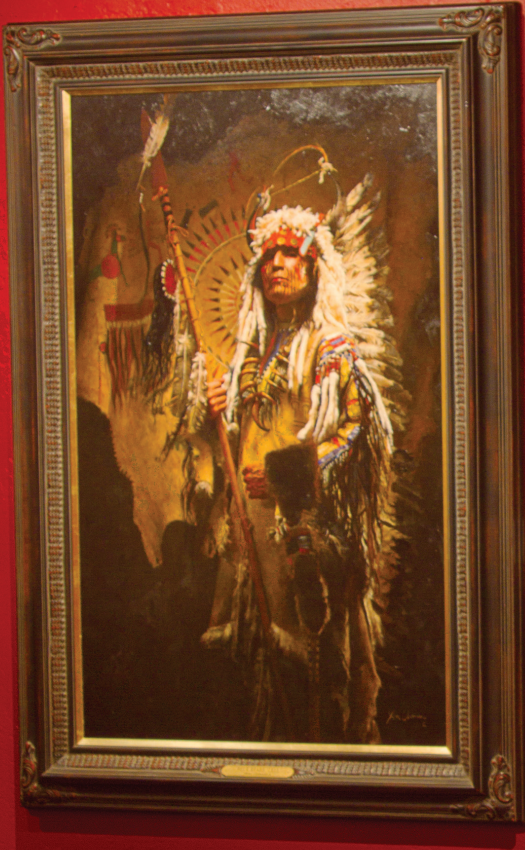
Small white informational label placed below the painting.