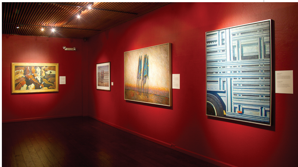
The West Observed: The Art of Howard Post exhibition organized by the Tucson Museum of Art and Historic Block. July 21 – Nov. 25, 2018