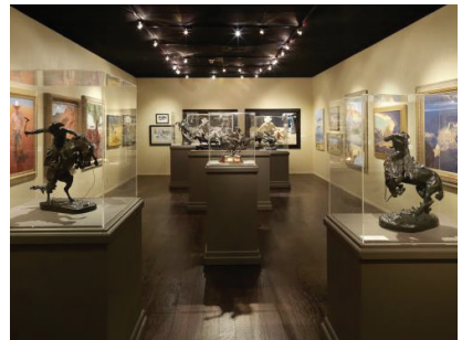
DCWM Permanent Collection