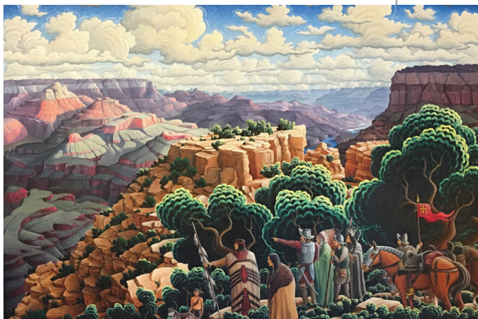
Kim Wiggins, Cardenas at the Grand Canyon 1540 A.D. , 2012, oil on canvas, 48" x72", Museum purchase Art Acquisition funds

For: display in Western Heritage Center, Prescott, beginning September 19, 2019