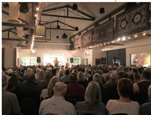
Dave Stamey concert

Facebook: 3,628 followers Twitter: 324 followers Instagram: 1,230 followers Ranch Dressing Social Media followers: 453 Facebook: 314 followers Instagram: 139 followers