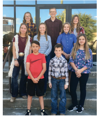
2019 Cowboy Poetry Award Winners