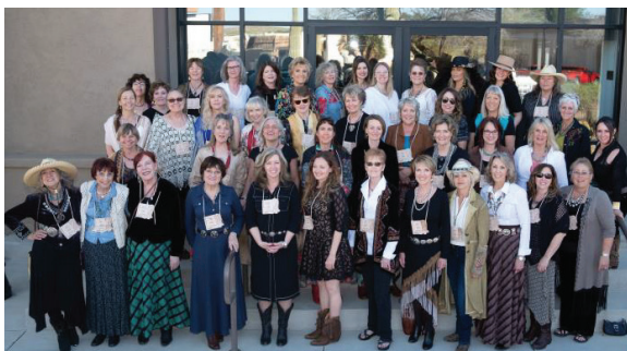
Cowgirl Up! 2019 artists, photo© Stan Strange

Fine Art Connoisseur Art of the West Western Art Collector