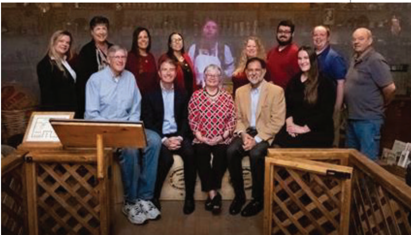
DCWM December 2018 Staff Photo