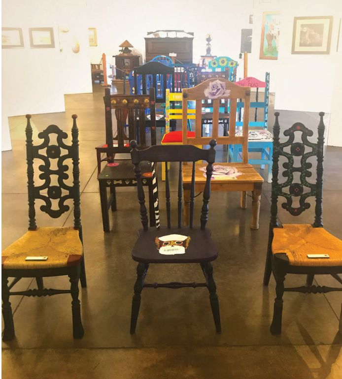
Day of the Dead exhibition, Oct. 26 – Nov. 4, 2018, memorial chairs created by Wickenburg High School Advanced Art Students