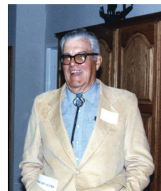
Aiken Fisher, DCWM archives