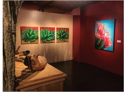
Flower Power: Desert Botanicals June 8-Oct. 20, 2019